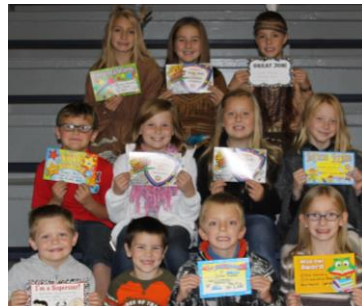
Sept. Citizenship Awards