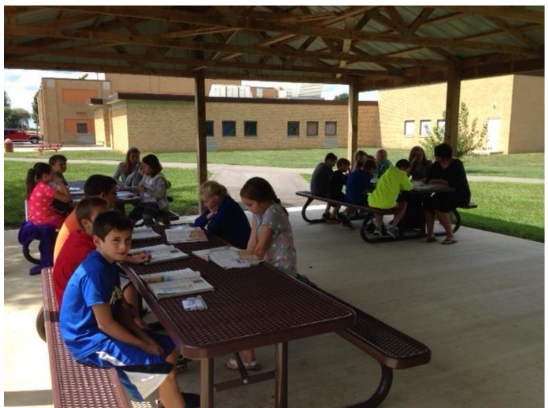
Ms. Powell's class takes advantage of the nice weather by using the outdoor classroom. Students above are reading and discussing a social studies unit in preparation of Native American Day, an annual event for students in grades 4 and 5.