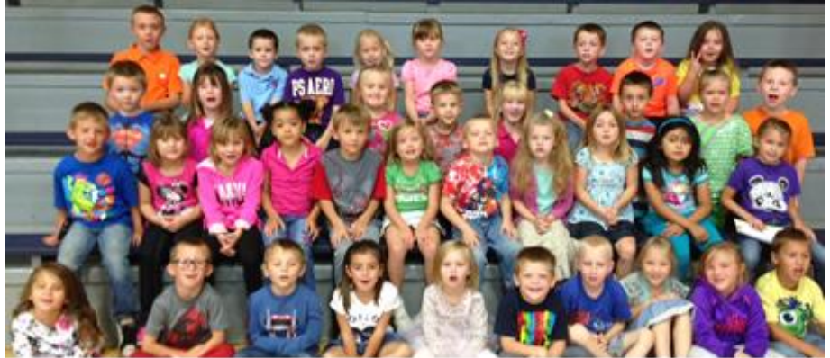
On August 7, Roachdale Elementary welcomed 40 kindergarten students to the school family. We look forward to all of their future successes!