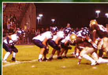
^The PAT unit sets up for the field goal attempt.