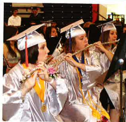
▲ A trio of flutists play with the band one last time.