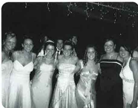
A group of junior girls line up for a picture.