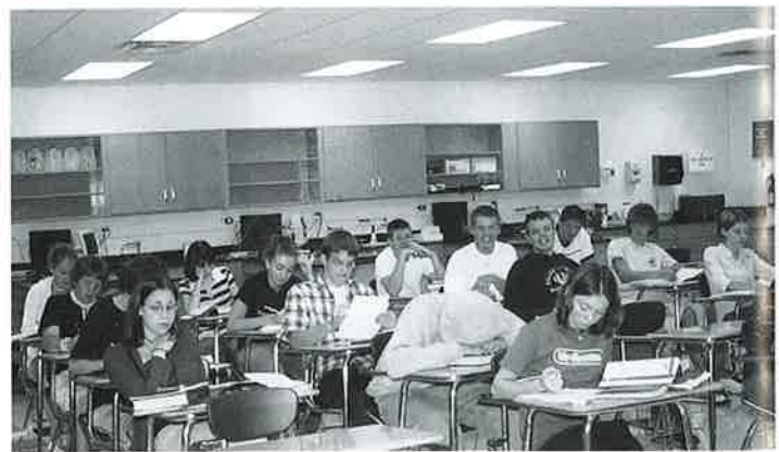
Students in ICP work through the class.