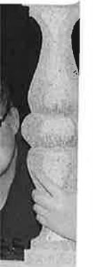
ws off a smile.