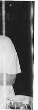
poses the wall.