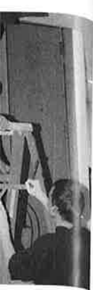
and Tim up the stage.