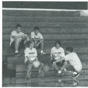
Break Time! A few students take some time at the end of class to stop and catch their breath. That's what free time's for.