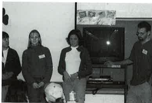
High School Heroes