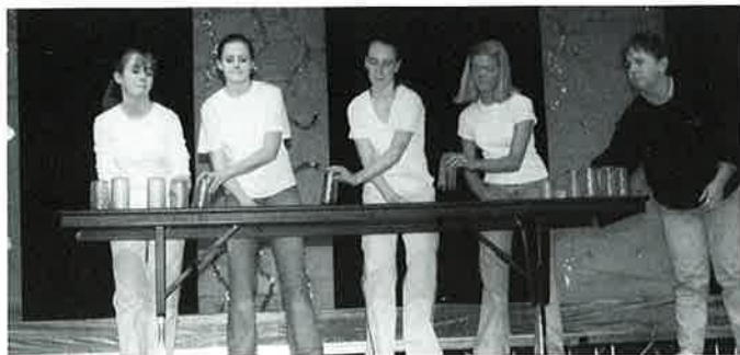
The Accoustics make some noise during their demonstration of the "Cup Concerto".