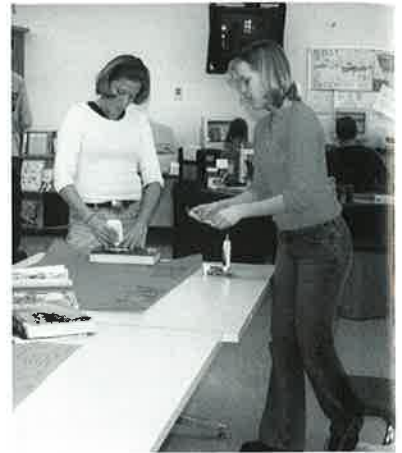
Students work on their Historical Collage of Time.