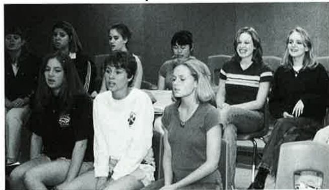
Choir students rehearse a song.