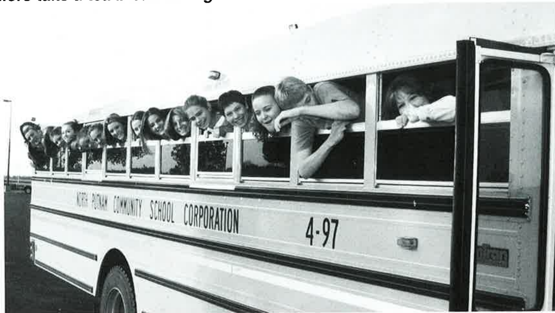
Field trips were an enriching part of the academic experience.