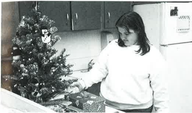
Which one is mine?