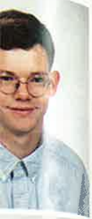
Donald Conniff Band 9, 10, 11, 12; Pep Band 9, 10, 11, 12; Plays and Musicals 9, 10, 11, 12