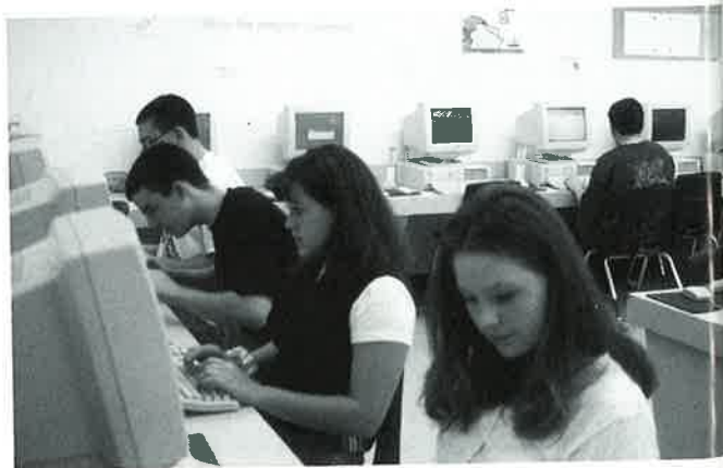
Typing Away... The computer lab was often the place to see students looking up resources for their research papers. Many teachers reserved the computer lab for the entire class period to give their students time to research and type their assignments. Many students also used the lab before school, during the new SRT period, and after school.