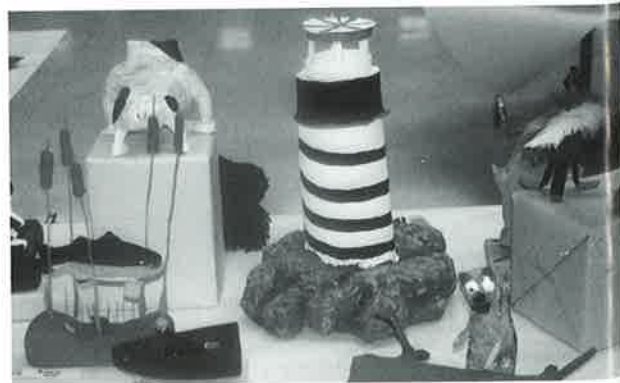
Art Show: Student art projects were displayed and judged during the annual art show which was held in the school cafeteria.