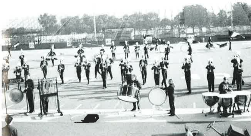
The North Putnam Marching Cougars performing Stormworks. They presented their show at Indiana State's Memorial Stadium during Mid-State competition.

North Putnam was host to the first-ever Cougar Pride Invitational at which fifteen bands competed. Although the Cougars did not compete, they did put on an exhibition performance for the crowd. Next, came the Mid-State competition at Indiana State University. Then, the band traveled to Evansville where they competed in regional competition. However, the highlight of the year for the band was a trip to Florida over spring break where the band marched at both the Epcot Center and Universal Studios. All in all, it was an extremely busy and successful year.