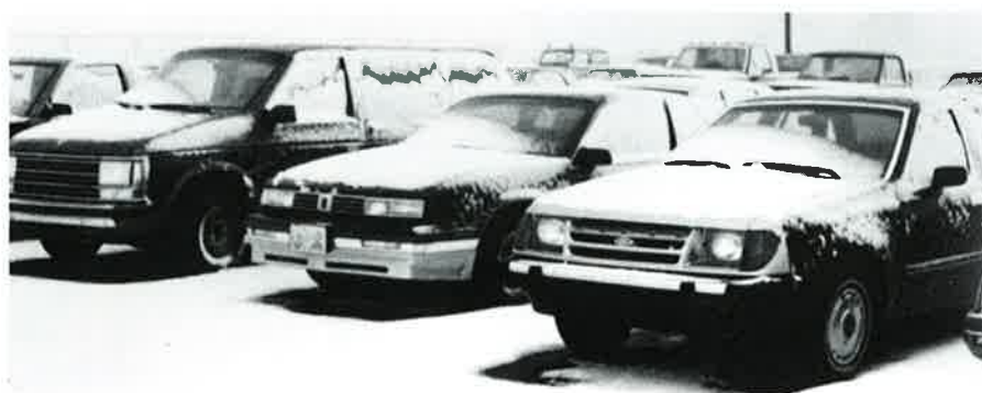
The students' cars are shown here covered in the many snow flakes that fell throughout this last school year.