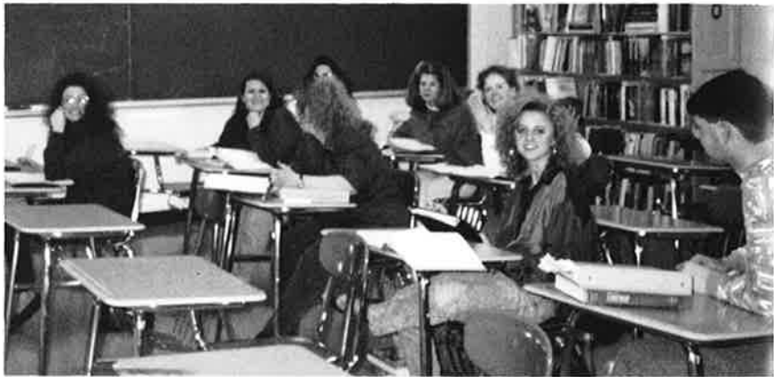
Calculus Class takes a moment away from their studies to pose for a picture.