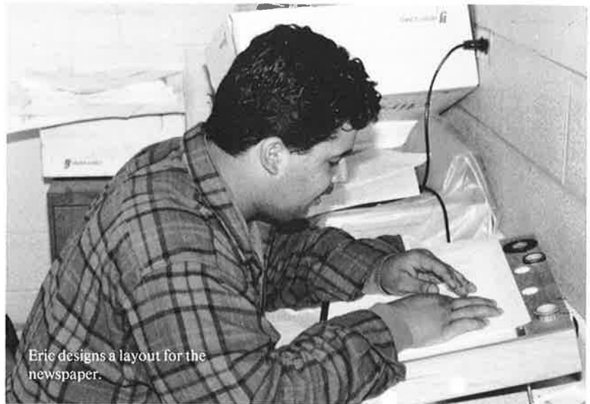
Erie designs a layout for the newspaper.