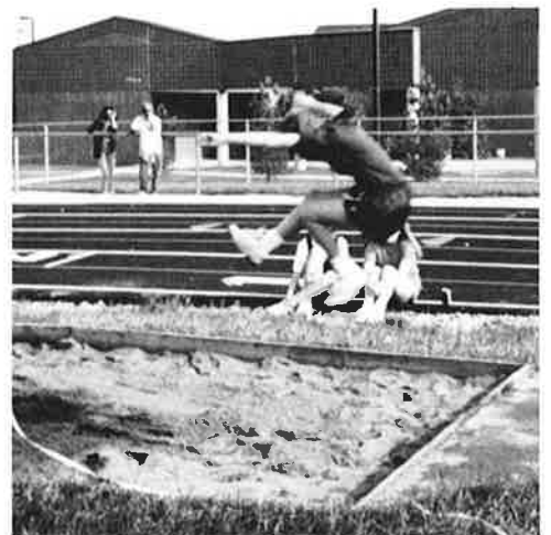
A girls long jumper leaps into the pit.