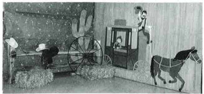
The ranch was a popular place for couples to get their pictures taken.