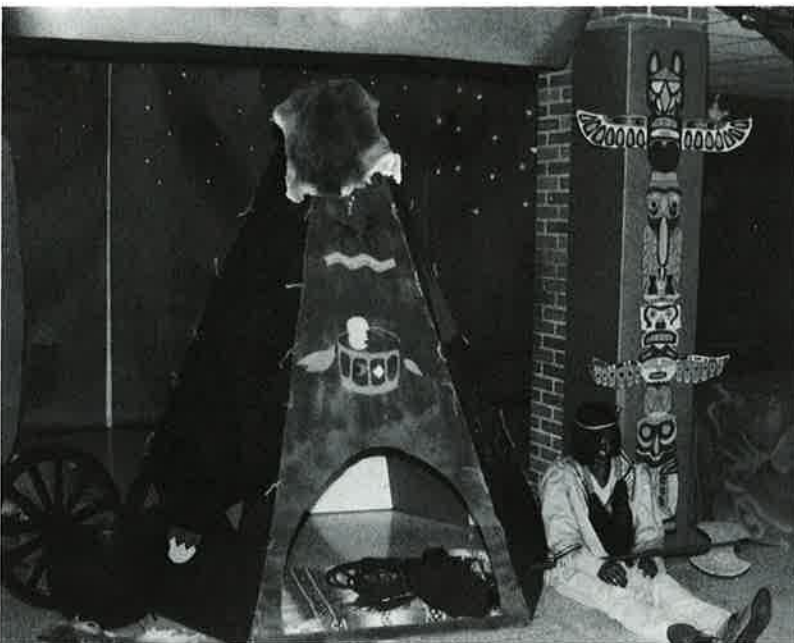
The teepee and Indian help add to the theme of "Wild Wild West."

In the North Putnam cafeteria most prom goers wound down the festivities by attending the post prom. This year's theme was "Wild Wild West." The students played games, won prizes, got their pictures taken and enjoyed free food.