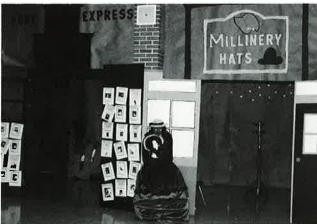
The Pony Express and the Millinery hats were just a few of the games available.