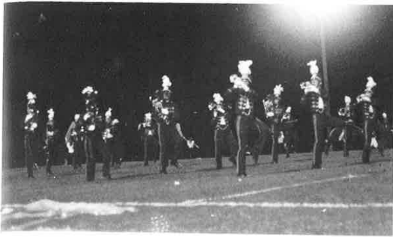
The band high-steps to one of their numbers.