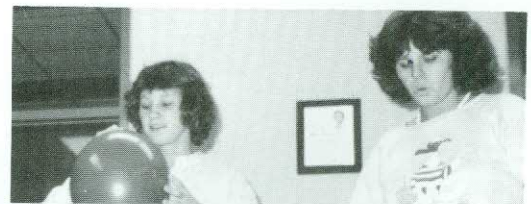
Could it be helium?