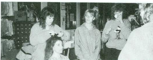
"The morning after."