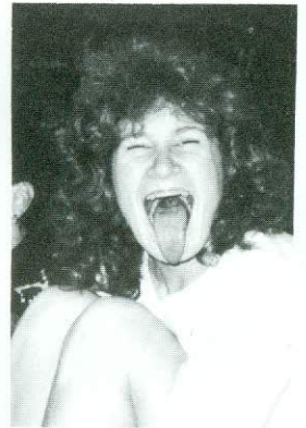
"Did you say morning swim practice?"