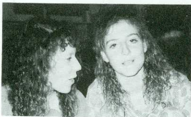
"Sleepy, don't be ridiculous."