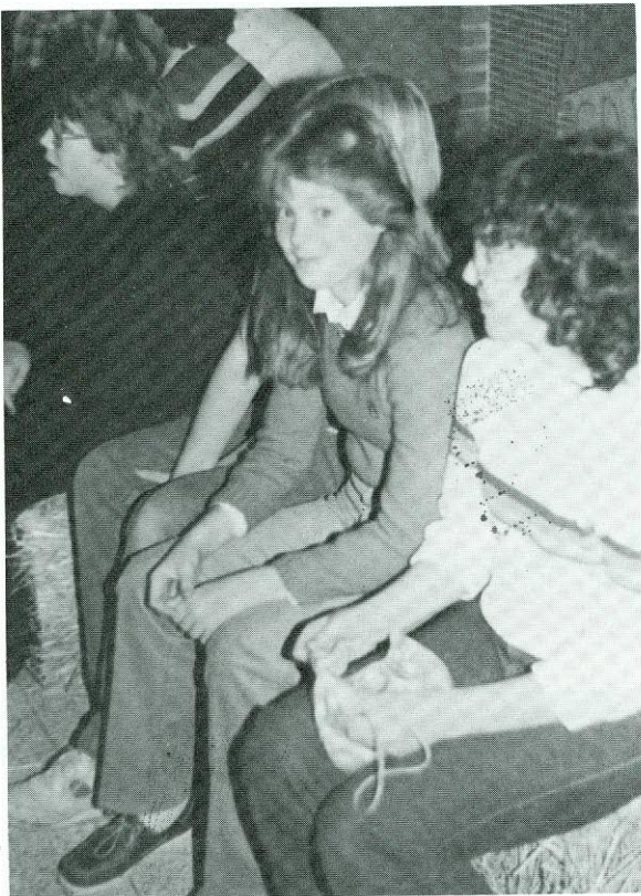
"This is boring!!"