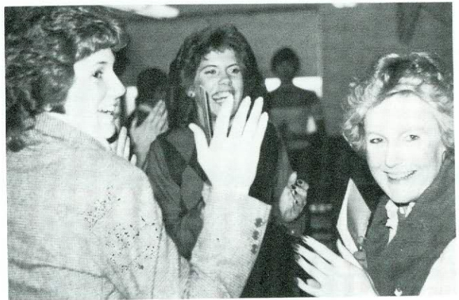
"Patty cake, Patty cake!"