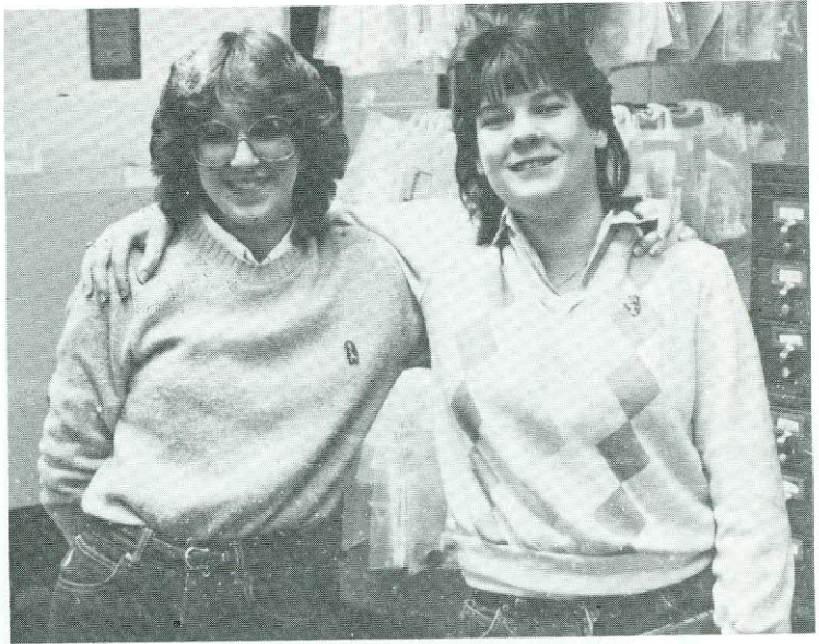
"Who says you can't have fun in the library!"