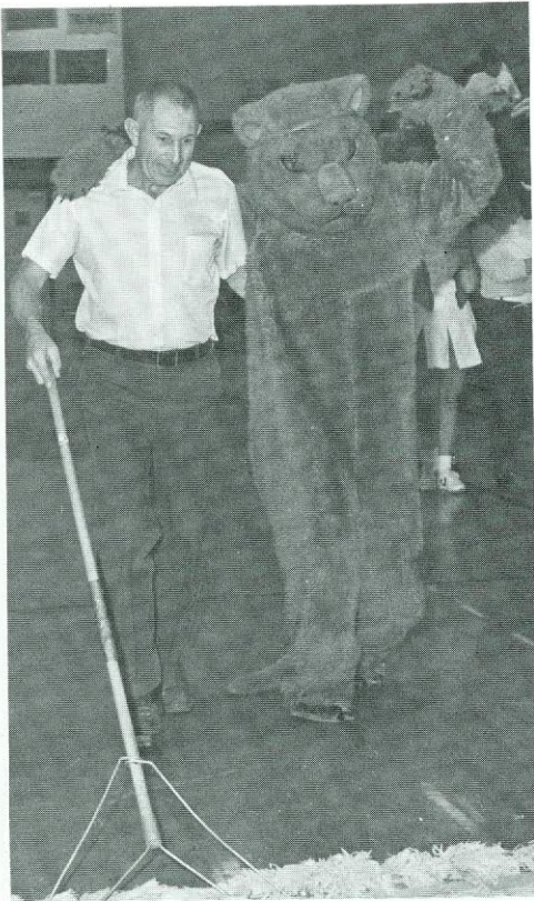
"Why don't you push and I'll strut!"