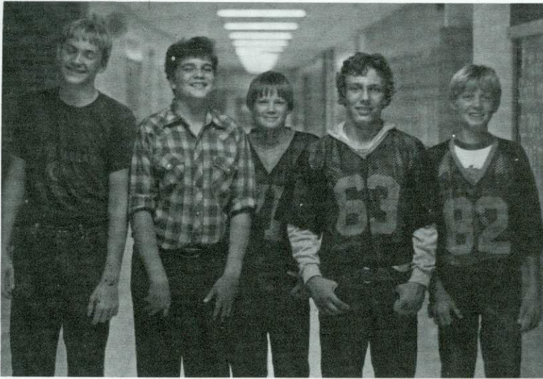
"We real cool"