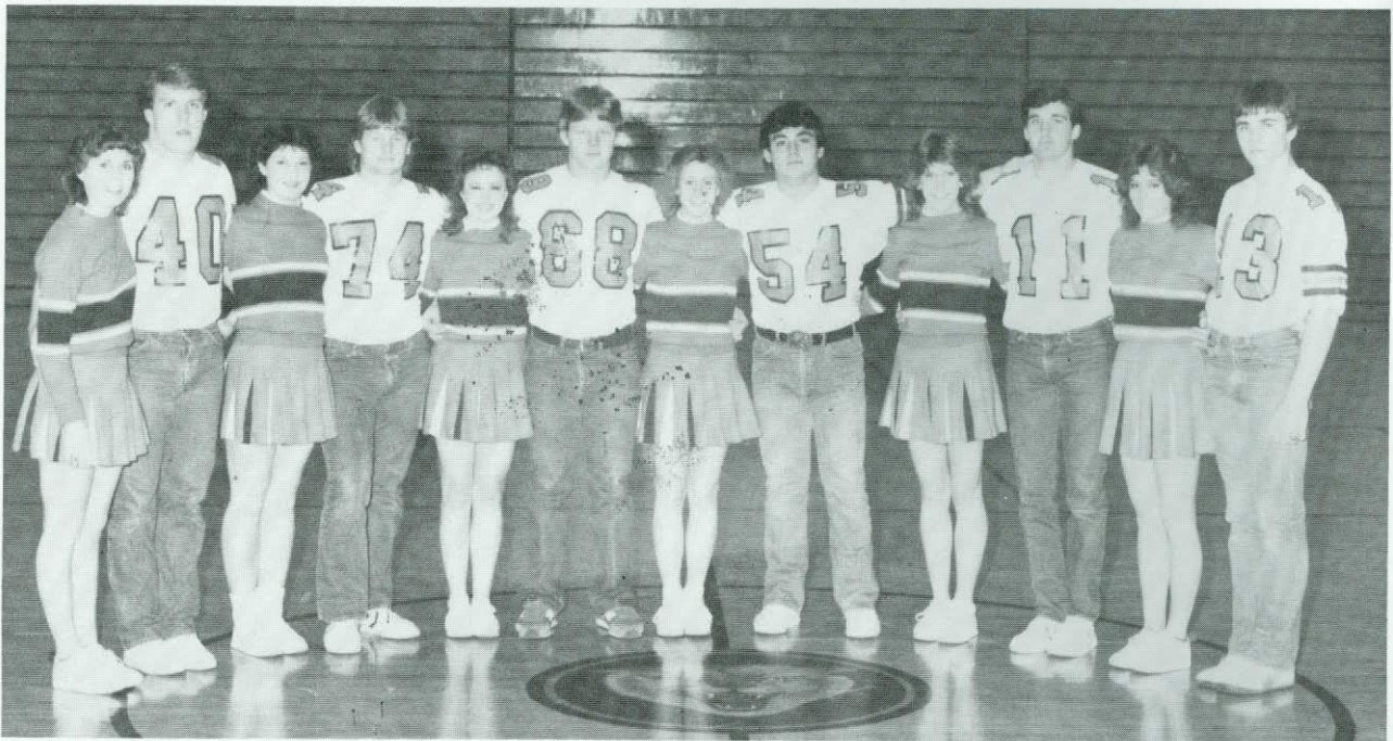
"Who's gonna start the cheer?"