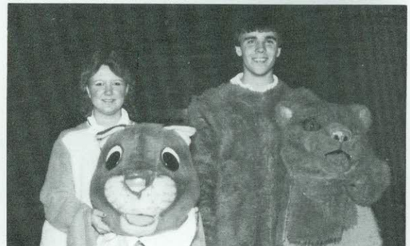
Two heads really are better than one!!