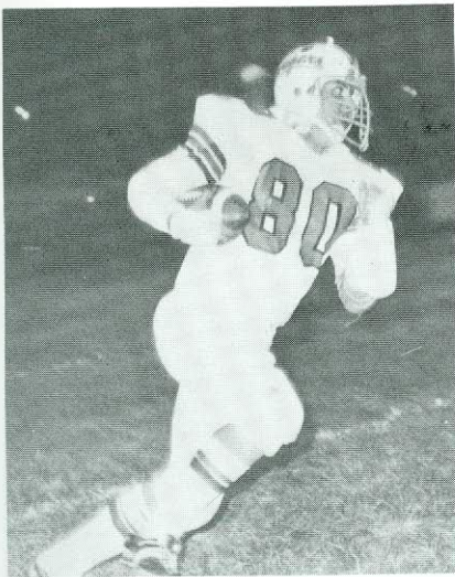
The Cougar team in ACTION!!!!

With the help of the coaches, parents and devoted fans the team finished the year with out a winning record but a record that each player was proud to acknowledge that his effort was always present.