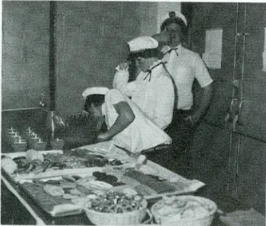
I told you this was "woman work"!!!