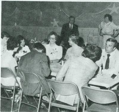
Do you suppose that there might be room for two more?