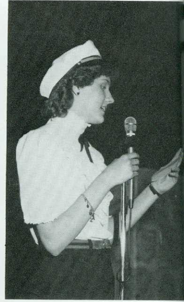
Would the owner of the Mercedes please put the top up—it's raining!!!!!!