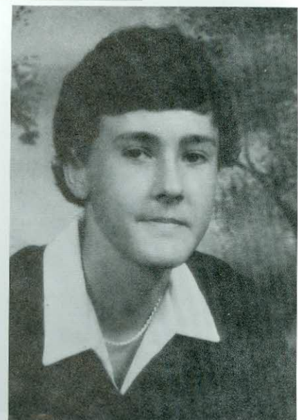
Maurice E. Nichols Photography Club 4, Soccer Club 1,2,3,4, Soccer 1,2,3,4, Cross Country 2,4