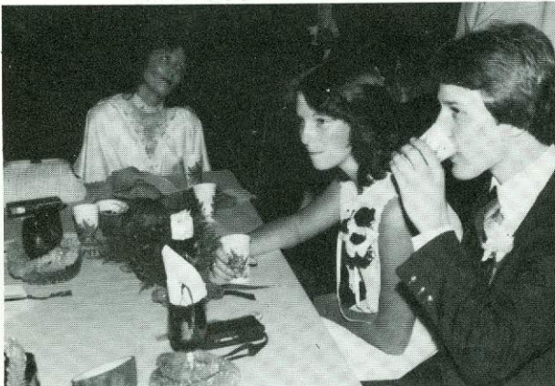
Let's sit this one out.