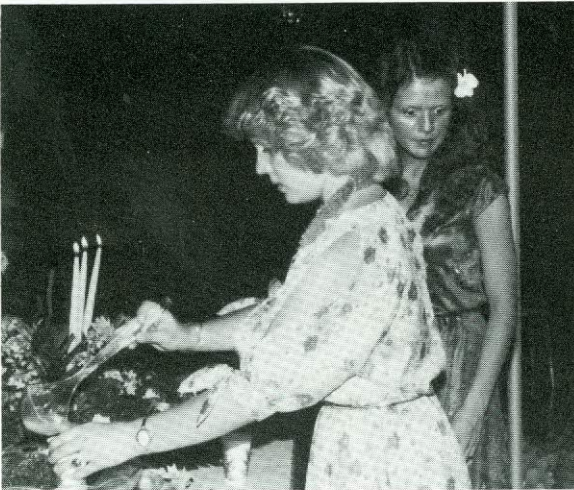
Servers enjoy their first prom.