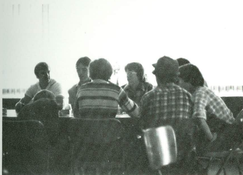
Small group prayers were a vital part of Wednesday morning meetings, followed by eating and sharing, in preparation for the day of classes.

Early risers on Wednesday mornings were fed spiritually, as well as physically, in the home ec living room at prayer breakfast. Fellowship began with group singing. Guest speakers shared Bible verses and testimonies. Small groups formed for special sharing and prayer. Then, breakfast of rolls, doughnuts, orange juice, and milk fortified everyone for a day of classes. A special closeness seemed to develop as Christians shared their love and concern for others and the need for letting "their lights shine" for Christ.