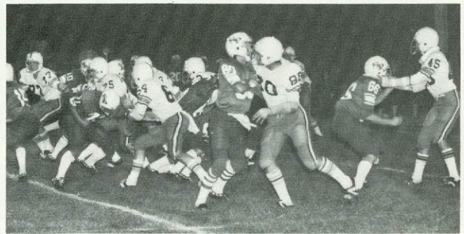
The Cougar defense smothers Eagle runner.