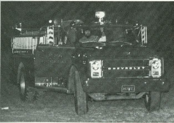
The sirens were kept busy as they celebrated each Cougar touchdown.