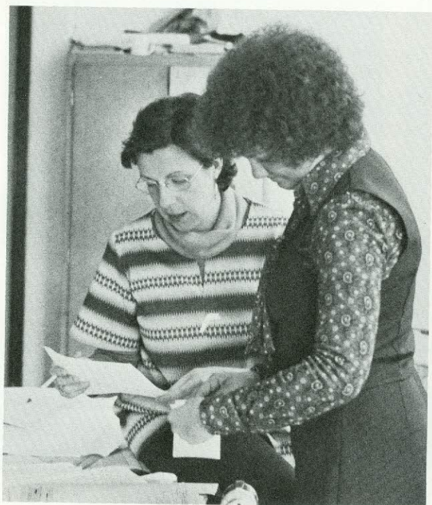
What do we do now?