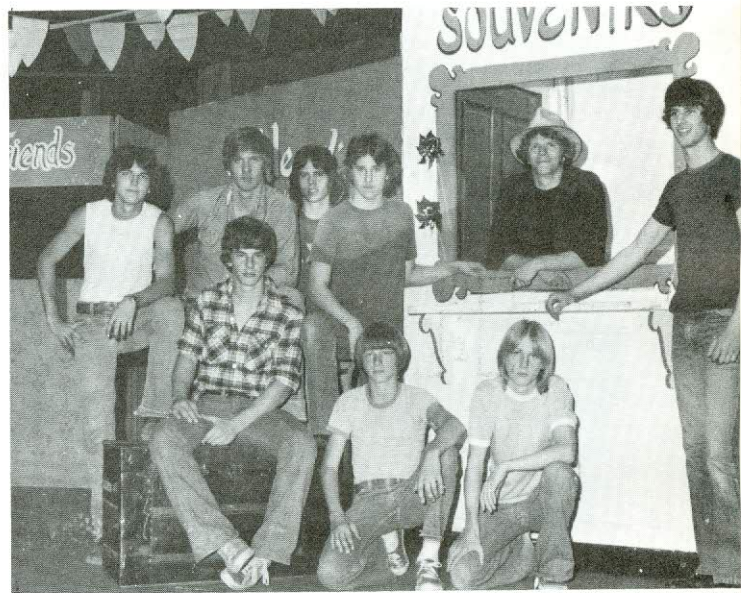
These roustabouts serve as the stage crew and also sing with the chorus.