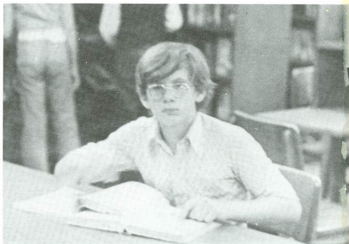
"What, me worry?"