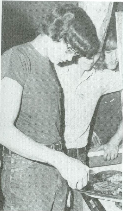
Aw, what good taste you have.