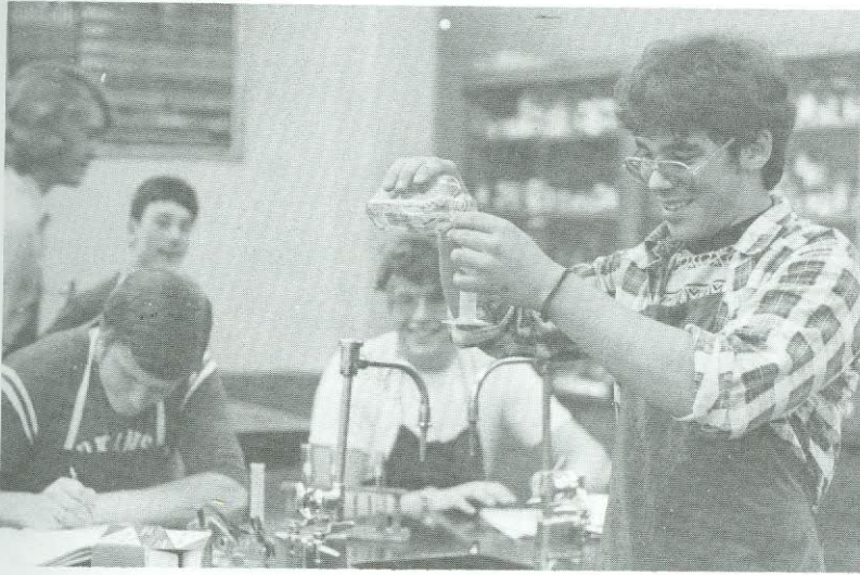
Dr. Jeckyl or Mr. Hyde???