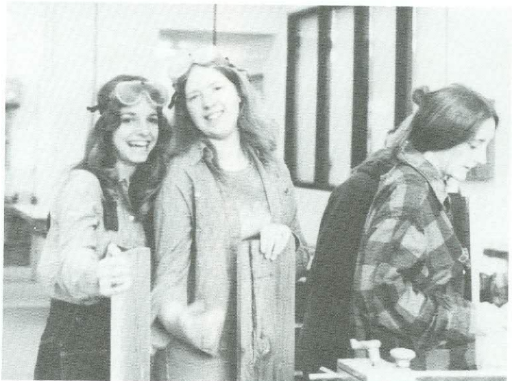
Who says girls aren't as skilled as boys???