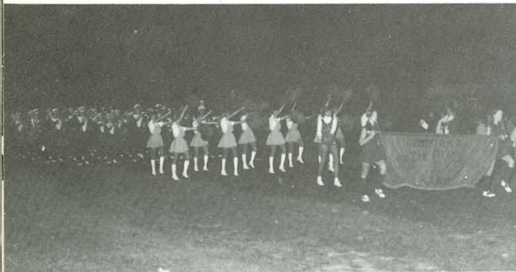
The North Putnam Band plays for the Cougars.