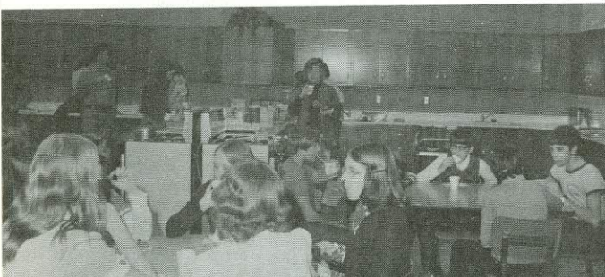
Wednesday morning Prayer Breakfasts, featuring frequent guest speakers, attracted students and faculty members alike.