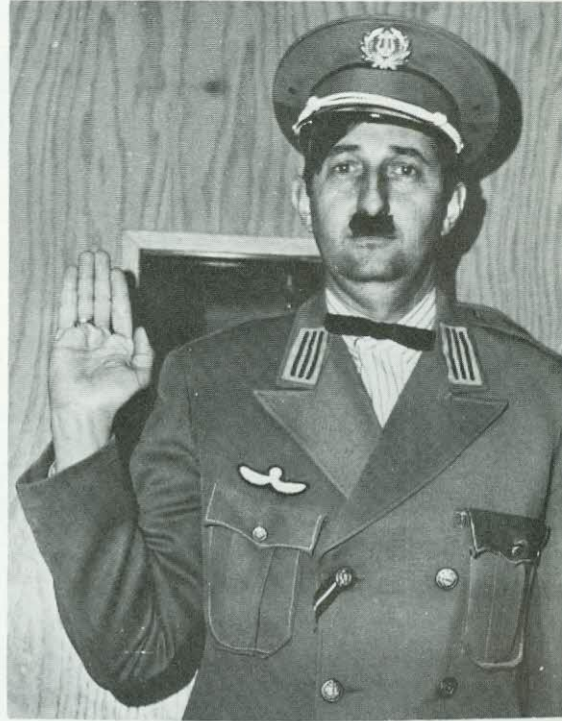
And I thought HE was in Argentina!!!!