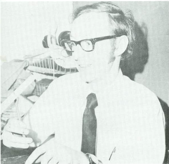
It gets to you after a while!