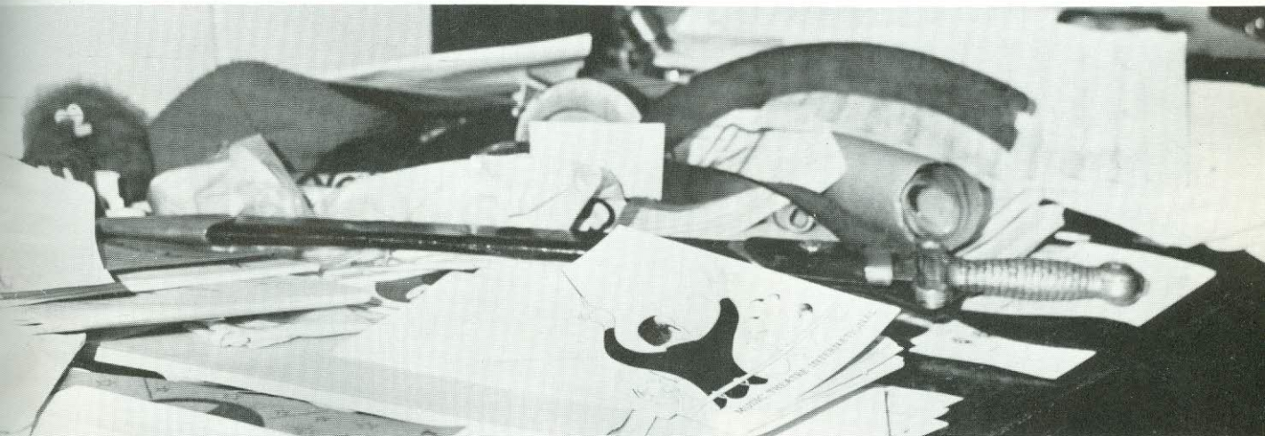
What no rats??