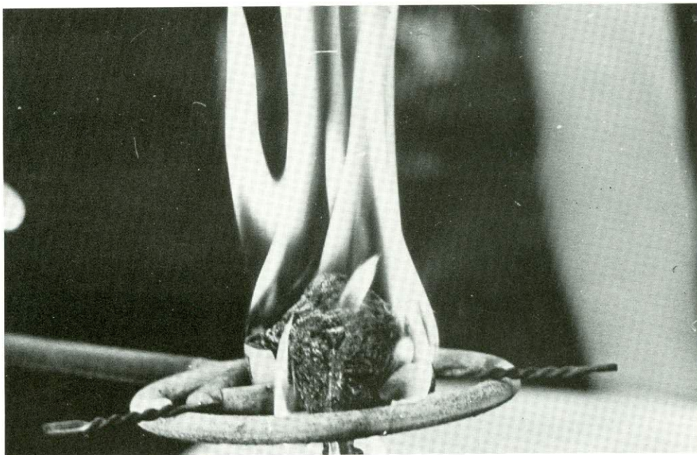
Experiments highlighted chemistry classes like this ritual on the bunsen burner.