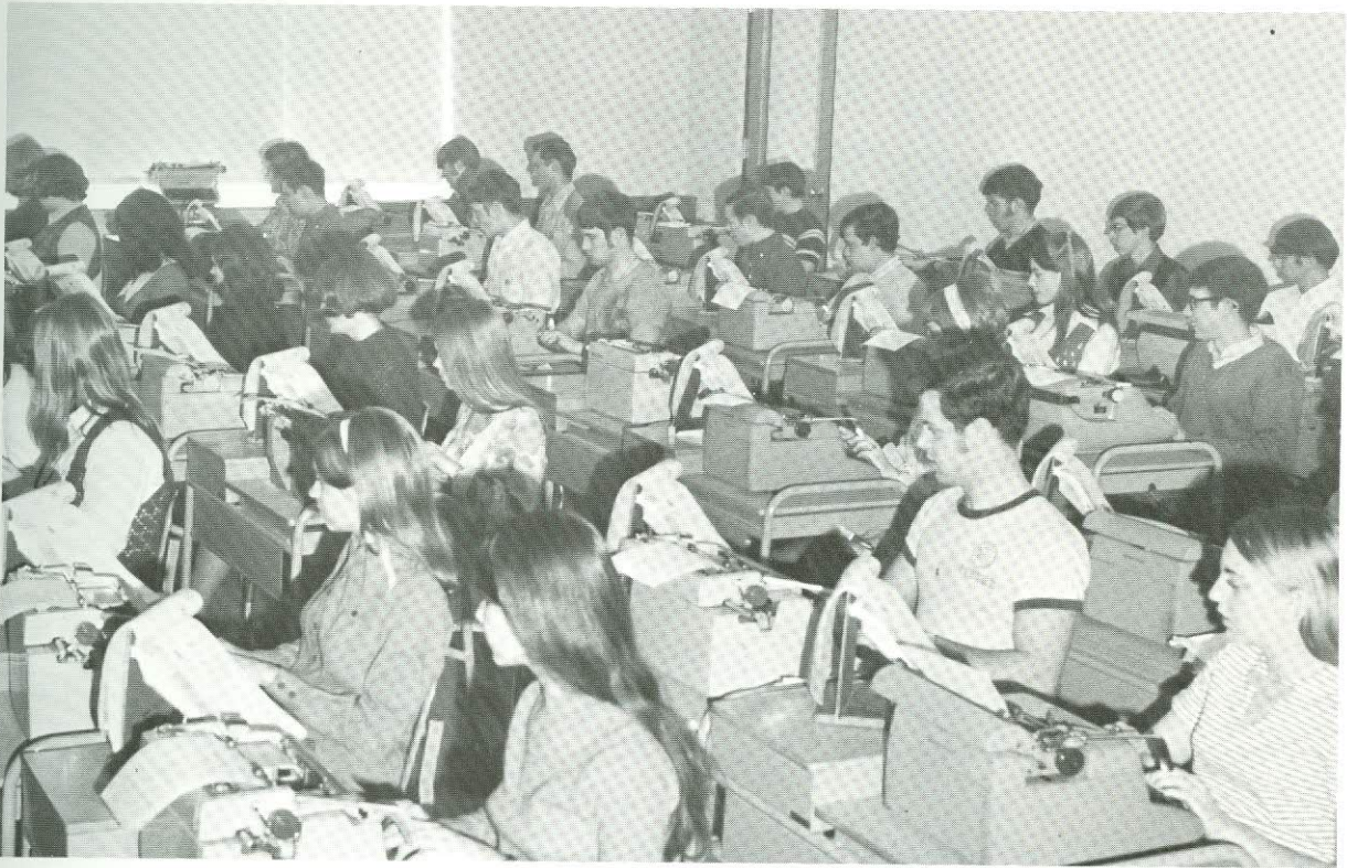
Timed typing tests sharpened competitiveness in business classes at North Putnam.