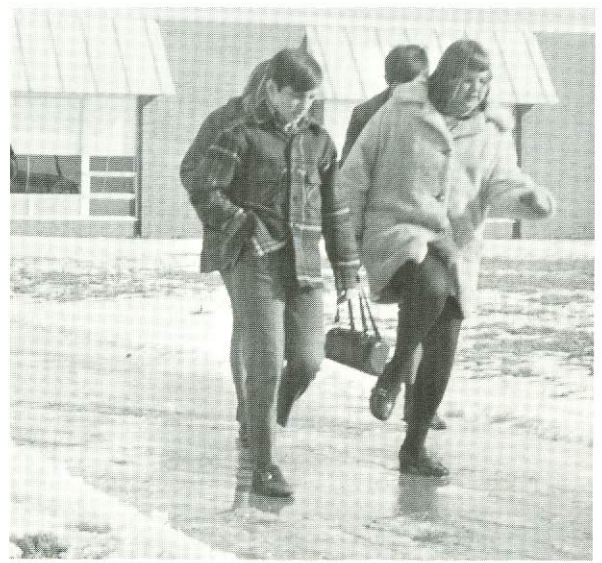
Students found the sidewalk in an icy condition as they cautiously made their way to buses.