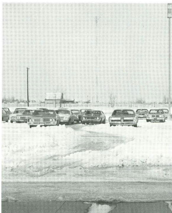
The poor parking conditions for cars proved to be a topic much discussed by faculty and kids.