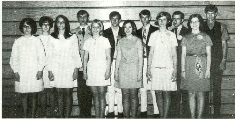
Senior winners of college scholarships received recognition during Awards Day. Due to academic excellence these students deserved applause.