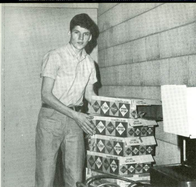
A sophomore helped stack cases of pop in the coke room.