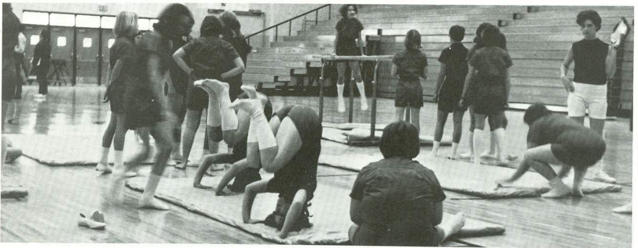
The eighth girls' gym class participated in many gymnastic skills this past year.

Among the many exercises which the boys' gym classes executed throughout the year was the climbing of the peg board.