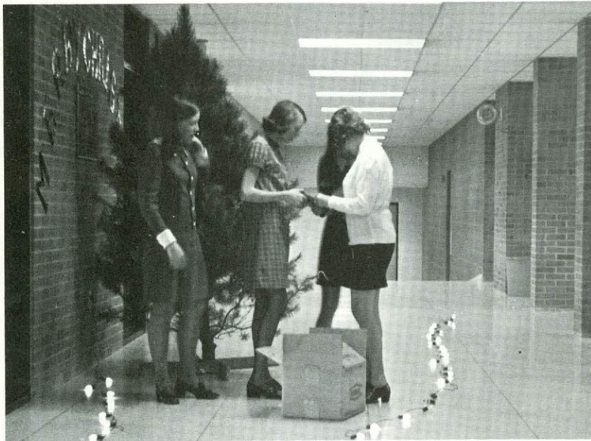
Lights, tinsel, pine trees, ornaments, and student council members encouraged the Christmas spirit throughout the school.